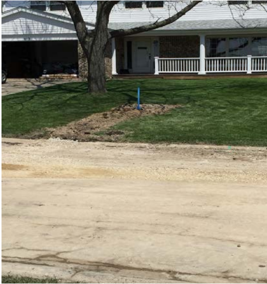
400 Block Beck Rd