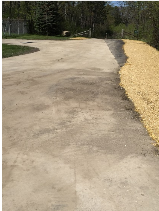
Forest Preserve Entrance