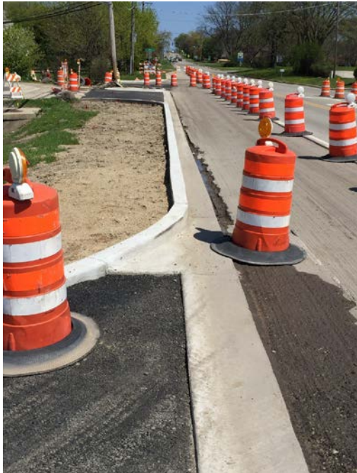
Sand Lake Rd