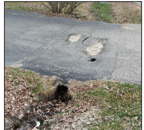
Pictured above is a culvert that was not properly maintained. As a result, the driveway is cracked and sinking.

These all may be signs that your culvert is damaged. For more information on how to maintain a culvert, please contact the Village at (847) 356-8252.