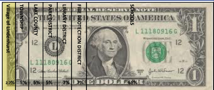
School Districts Lake County, Lake Township, Park District Library District, Fire Protection District

As depicted in this picture, the Village of Lindenhurst receives less than 3% of your total tax bill. A $250,000 home pays an average annual tax bill of approximately $9,300 with just $261 of that going to the Village.