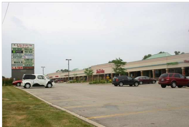
THE LINDEN PLAZA RETAIL CENTER